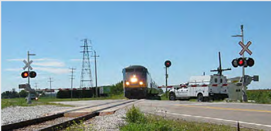
This crossing on Highway 2, just west of Chatham, Ontario, was one of 21 VIA Rail crossings that PNR RailWorks upgraded on the Chatham Subdivision. The S&C crew installed two new crossing protection gates, a new bungalow and all new cable at this location.

PNR RailWorks' Signals & Communications division is wrapping up work on a project that its customer, VIA Rail, says will improve the safety, frequency and speed of passenger rail service all along its busy Toronto-Windsor route.