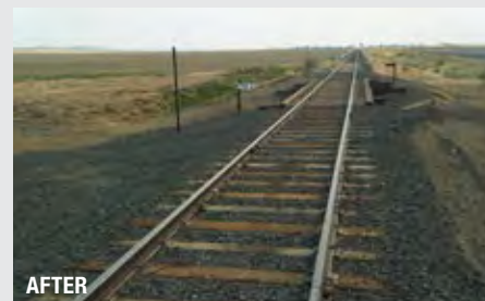
The RailWorks Track System's crew based in Spokane, Wa., completed emergency work on the Eastern Washington Gateway Railroad near Hartline, Wa., after a flash flood washed debris into a bridge and along the track.