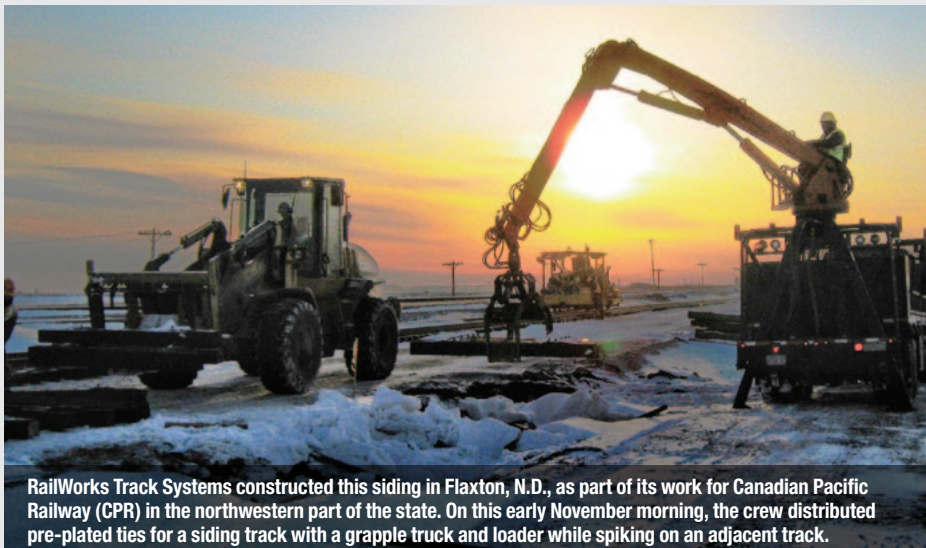
RailWorks Track Systems constructed this siding in Flaxton, N.D., as part of its work for Canadian Pacific Railway (CPR) in the northwestern part of the state. On this early November morning, the crew distributed pre-plated ties for a siding track with a grapple truck and loader while spiking on an adjacent track.

RailWorks Track Systems was one of a throng of businesses drawn to North Dakota during 2011 in response to a modern-day oil boom. At the end of the year, nearly 100 employees had racked up more than 55,000 man-hours on seven projects and constructed or rehabilitated 35 miles of track, all without incurring a single lost-time incident.